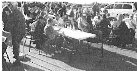
The soccer and football fans enjoying a delicious dinner.