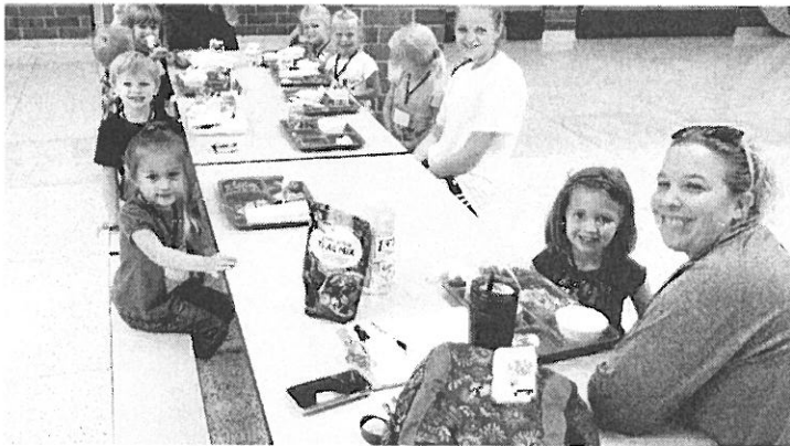
Students having a nutritious lunch before they go home for the day.