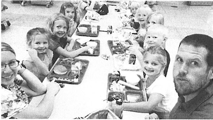
Summer school second session.