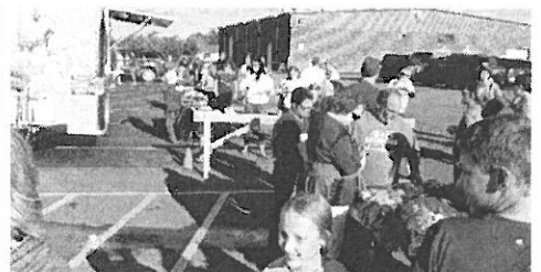
Fans getting ready for a competitive soccer and football game at Raider Field.