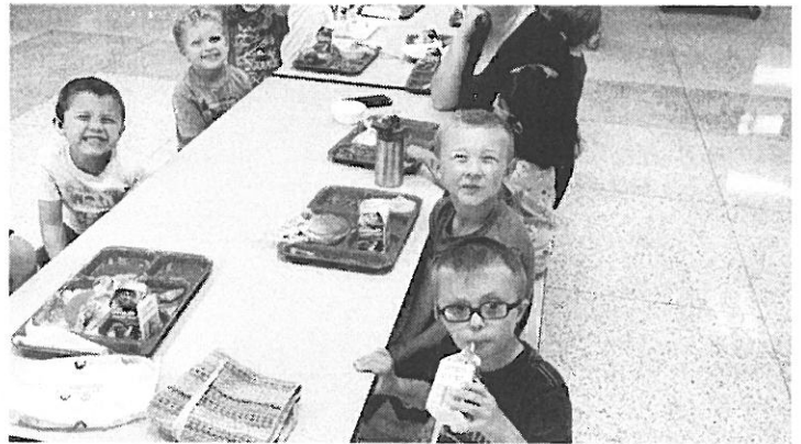
The kids enjoying a delicious lunch at MAES.