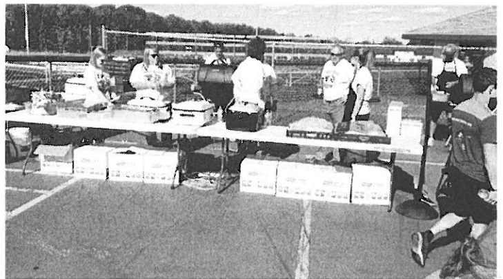
District staff setting up for a fun night at the new field.