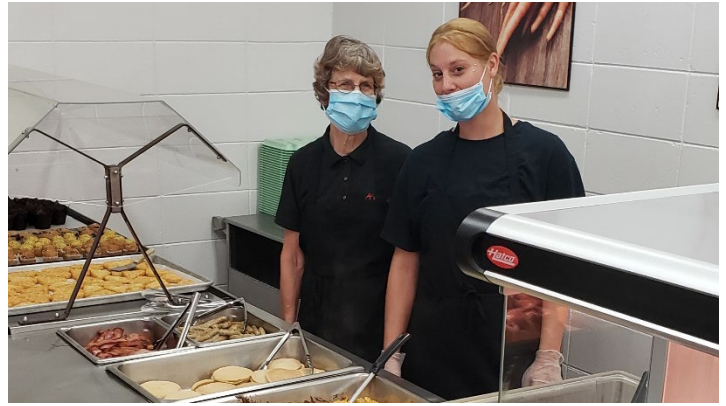
Thanks for all your hard work