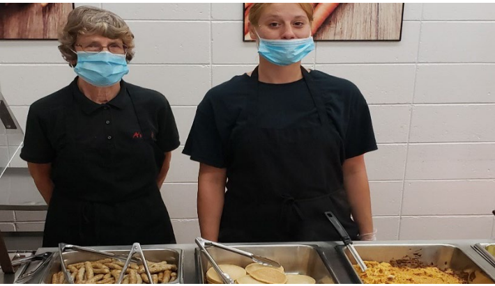
.Look at those smiles