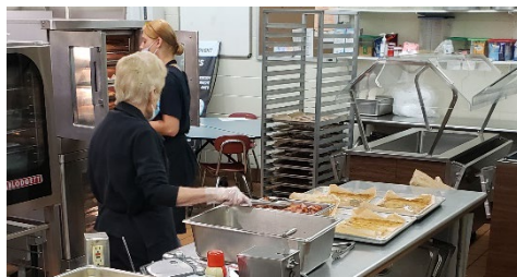
Working hard for the students