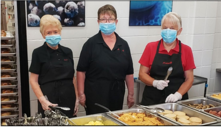
Getting ready for a delicious breakfast