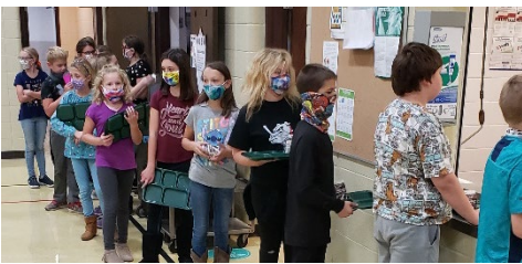
Love those masks!