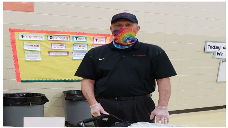
Getting ready to sample some delicious apples.