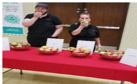
Aviands employees enjoying some Black River apples.