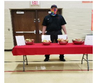
Look but don't touch.