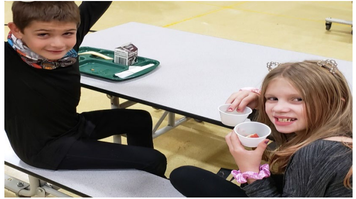
Apple Crunch fun at SES.