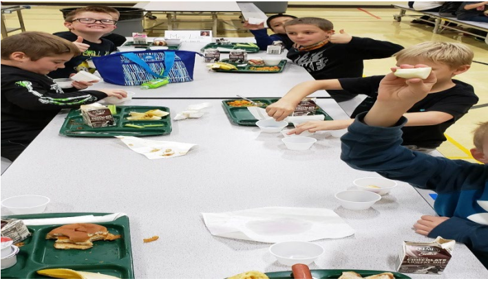
SES students sampling the different apples.