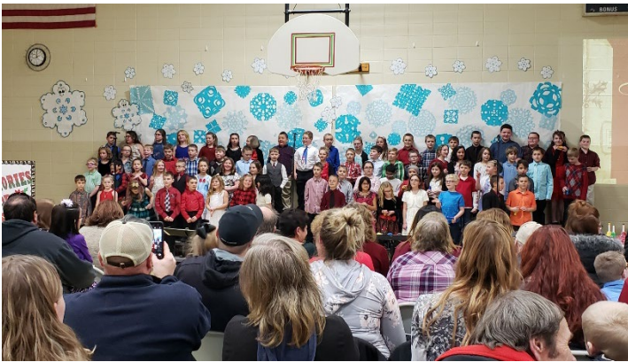
Enjoying cookies and punch at the Christmas concert.