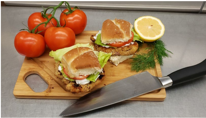
Pork Schnitzel Sliders for Global Bites