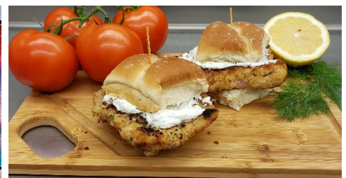
Enjoying the dill spread on the sliders.