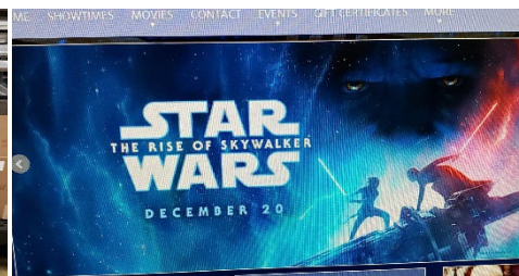
Christmas party at the Broadway Theatre. Love their popcorn!