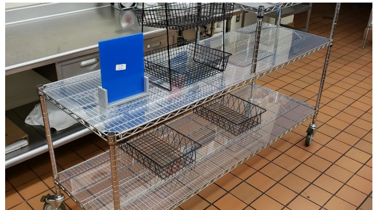
New Breakfast cart assembled and ready to go.