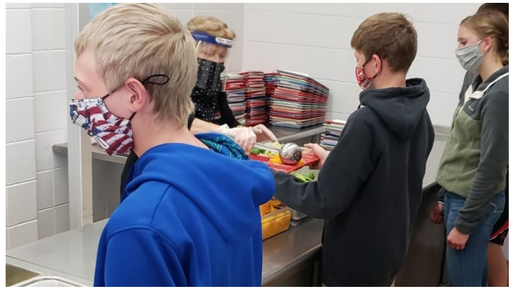
Students being served every item to keep them safe.