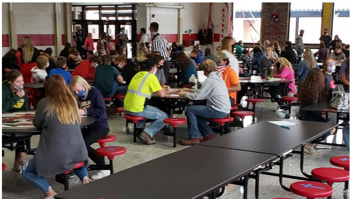
MASH students eating a health nutritious lunch