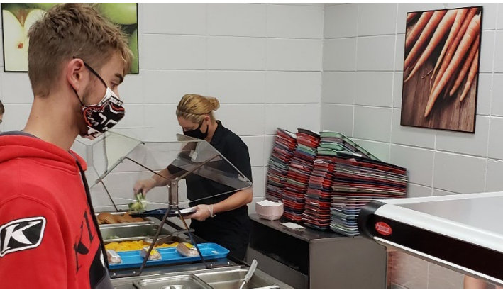
Good job with social distancing!