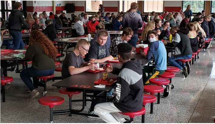
New cafeteria look in the times of Covid.