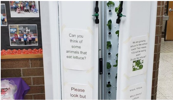
MAES students love their flex farm and growing some produce.