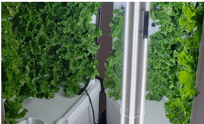
Flex farm at the AG department.