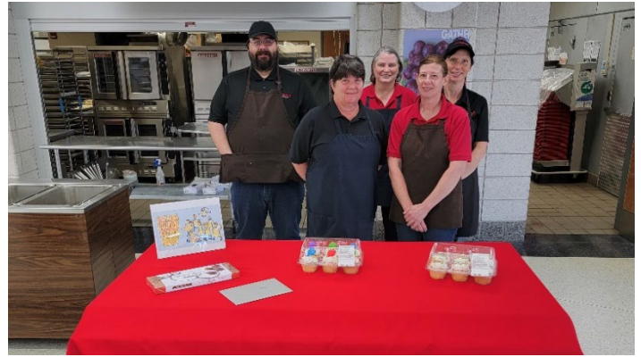
MAES team. Happy hero's Day!