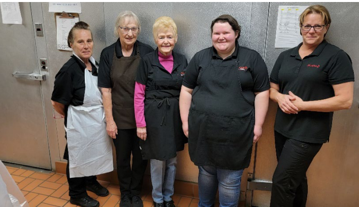
MAES team. Great job this year offering nutritious meals and amazing customer service!