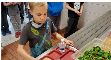
MAES students eating the lettuce they grew with the flex farm.