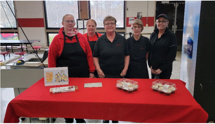
MASH team. Happy cooks day!