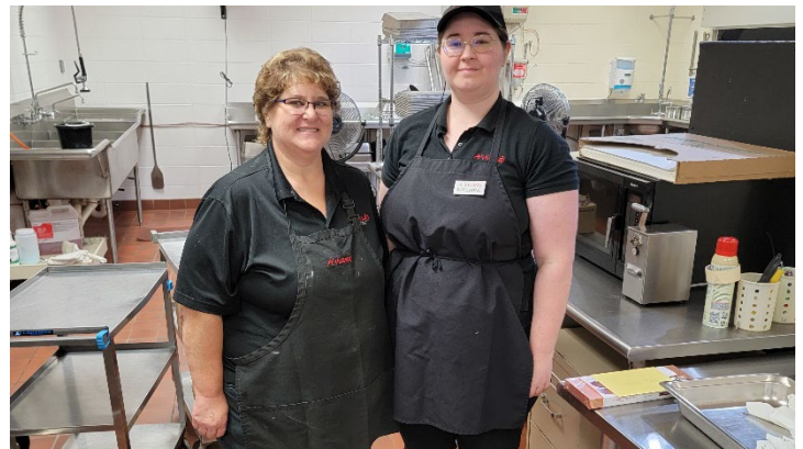
SES team. Happy cooks day!