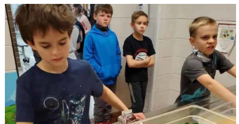
Students can't wait to enjoy some salad.