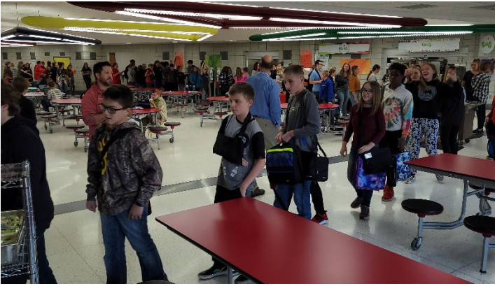
Students at MAMS coming for breakfast after the bell.