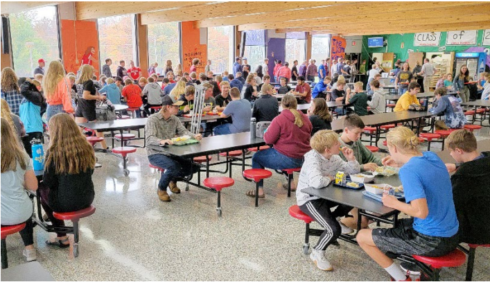
Long lines at MASH with 10 minute wait times. This is the main line.