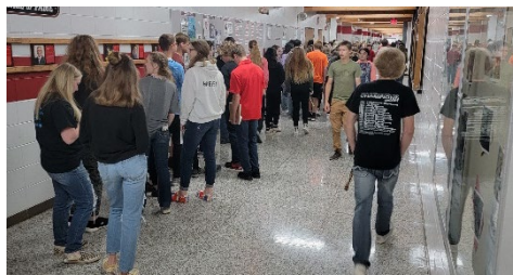
150 plus students use the brain break each day.