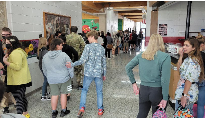
This is the second line at MASH. This line serves 50 to 100 students depending on the option that is offered.