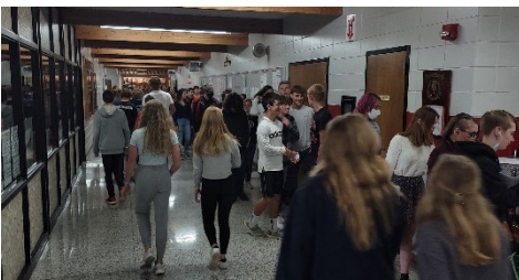
MASH during brain break. 5 to 8 minute wait times.