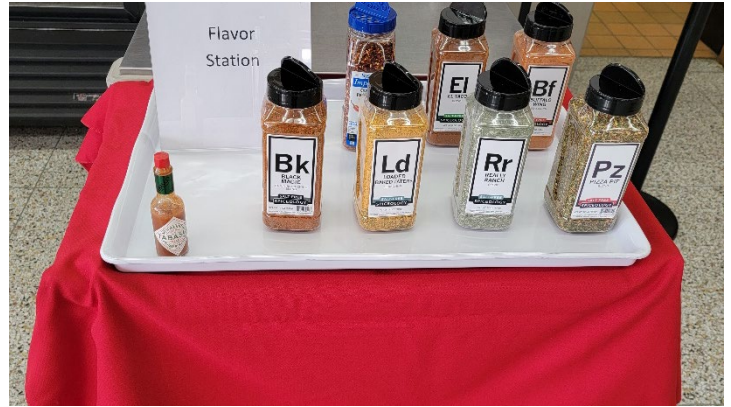
New Flavor Station at MASH. Students love the option of some extra spice.