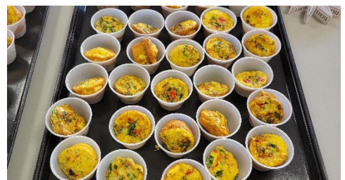
The winner for Food For Thought was the Egg Cup Cakes.