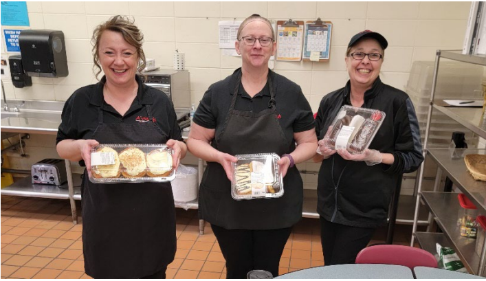
Look at those smiles! I appreciate my cooks!