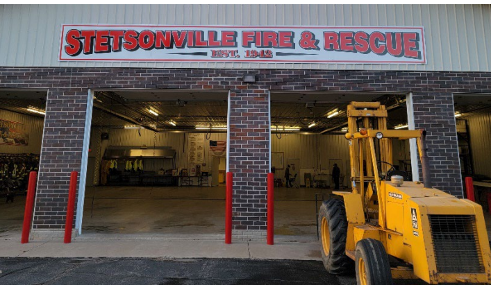
Stetsonville firefighters Thanks the Medford School District for donating a potato peeler. It was a big time saver for the annual pancake breakfast.