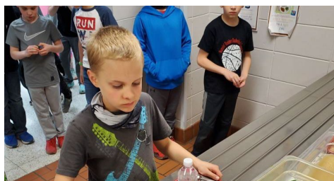
MAES students eating the lettuce they grew with the flex farm.