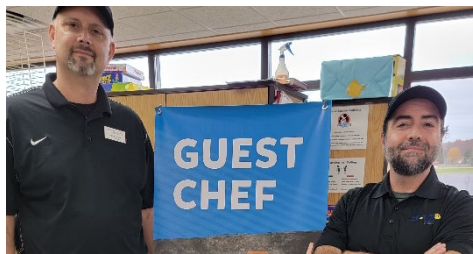
A new program in Medford called Guest Chef.