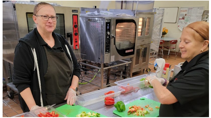
Kitchen staff prepping freshly picked peppers from Cattail Organics in Athens.