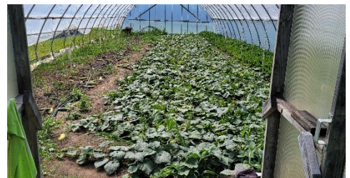
One of many crops at Red Door Family Farm in Athens.