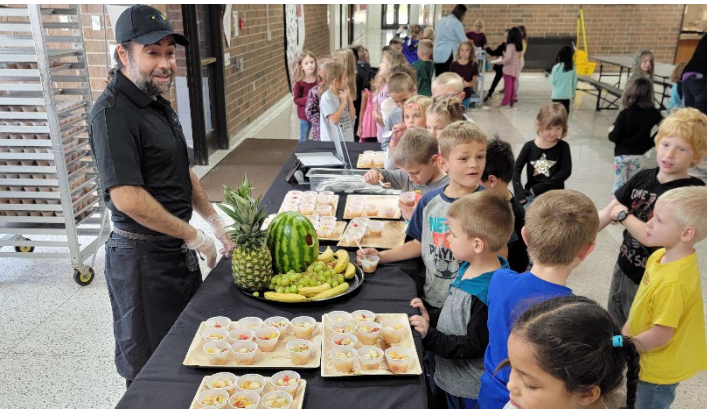
Guest Chef talking with the students at MAES about the tropical apple fruit salad.