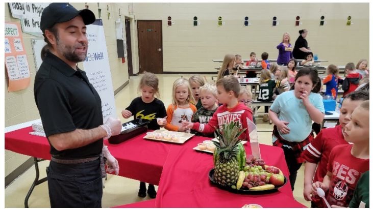
Chef talking with the SES students about many different fruits that are available.