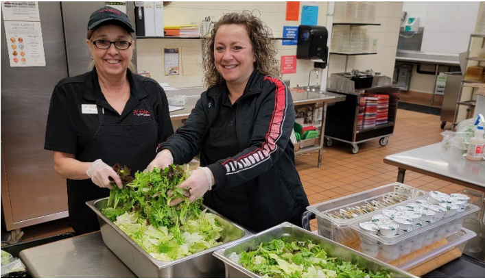
Fresh salad mix from Cattail Organics.