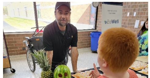
A MAES student talking with Chef about what he liked and what he didn't like with the tropical apple fruit salad. Love the feedback from all the students.