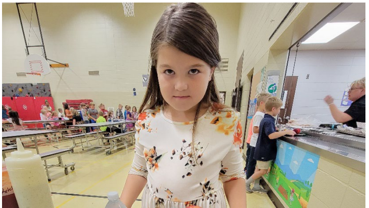
A student enjoying a locally grown apple.