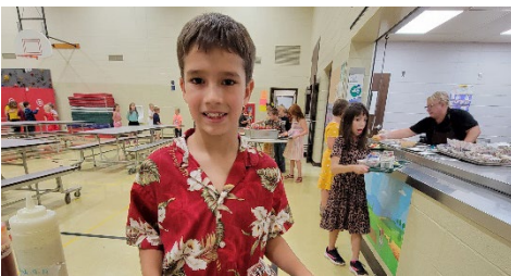
Great looking lunches for our students.