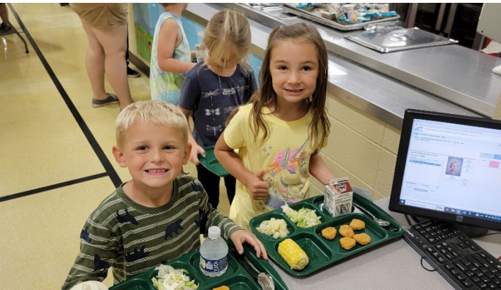
Students enjoying corn on the cob from the FFA students.