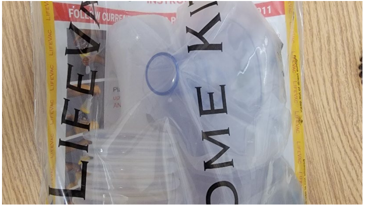
With the permission of nurse Mindy Aviands purchased lifevac's for every school in the district. Looking for ways to help if an emergency happened. Lifevac is a device that can help a person that is choking on food.