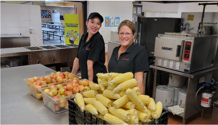
MAES staff preparing fresh produce. Corn on the cob was purchased from the FFA students.