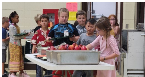
Looking forward to new serving lines coming soon.