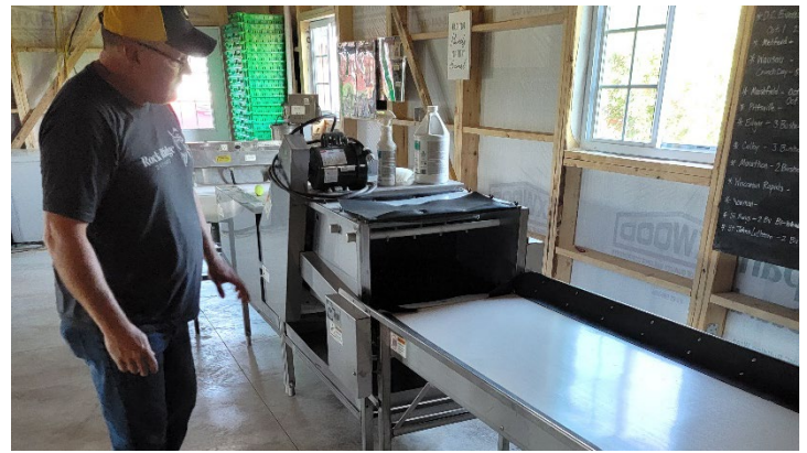
Machine to wash freshly picked apples at Rock Ridge Orchards.