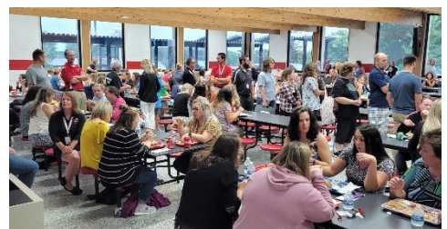
Teachers and staff enjoying the back to school picnic