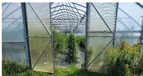
Looking forward to bringing in some fresh herbs and spices.