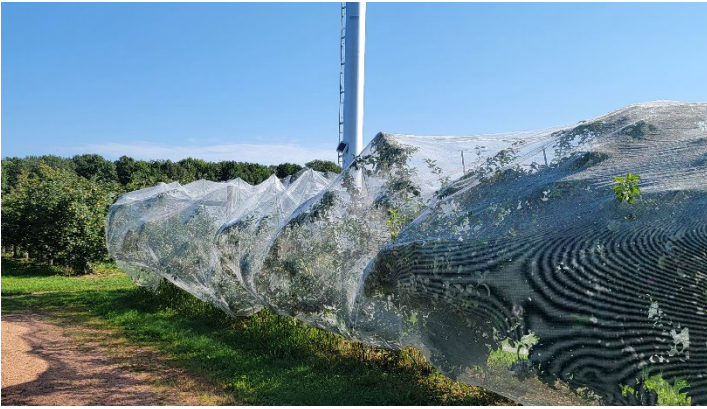
Rock Ridge Orchard. Nets keeping the apples safe from hail.