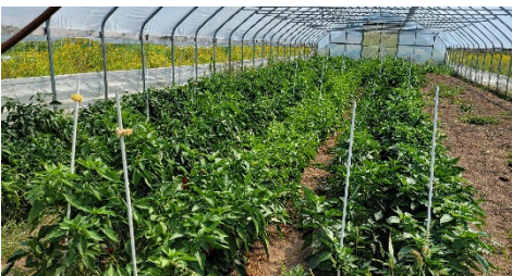
Green house at Cattail organics.