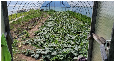
Green house at Red Door Farms.