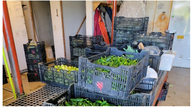
Red Door Farm fresh produce picked and delivered same day.