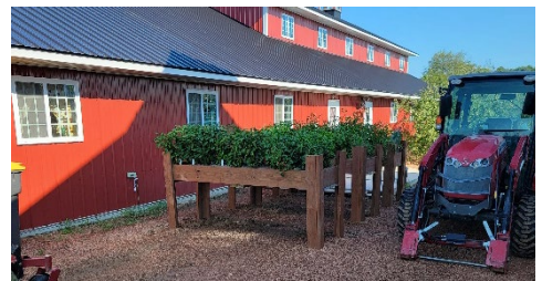
Over 30 varieties of apples at Rock Ridge Orchards.