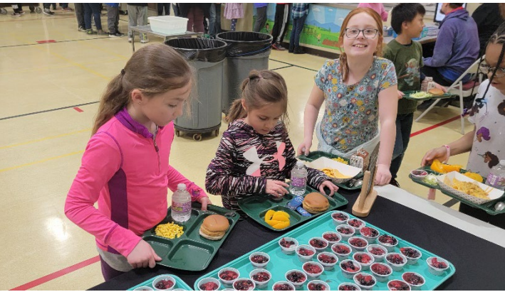
Students at SES coming back for seconds. They love the samples.