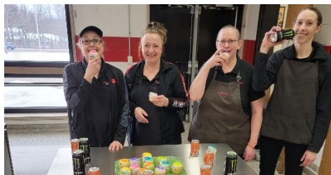
MASH team. Thank you for all you do!