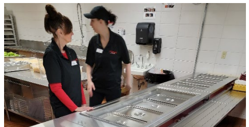
New serving lines installed at MAES.