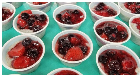
Getting the samples prepped up and ready to go.