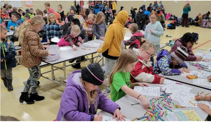
Celebrating National School Breakfast Week with the students.