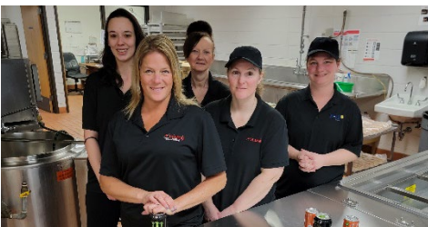
.MAES team. Great job!