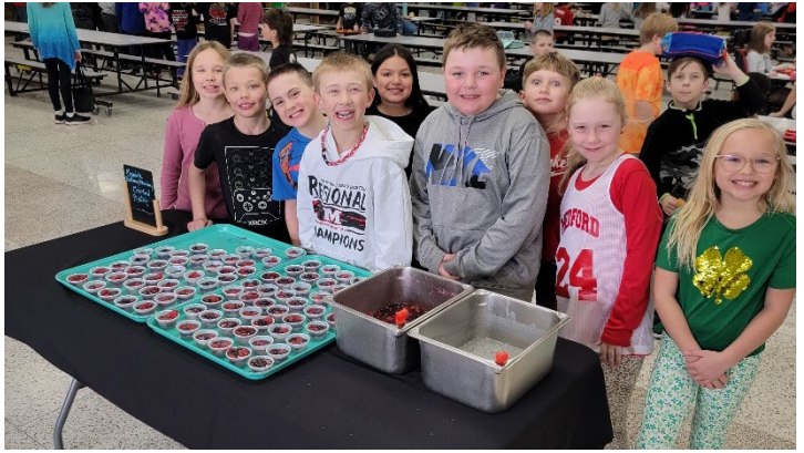
Look at those smiles! Sampling Mixed Berry Chia Seed Pudding at MAES.