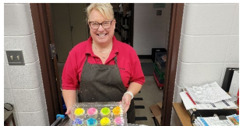
Our hero at SES.