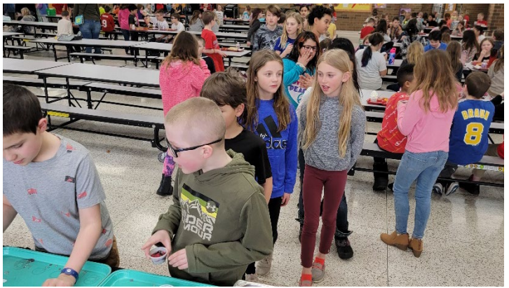
The line is growing at MAES for some free samples.