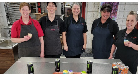
Celebrating School Lunch Hero's Day at MAMS.