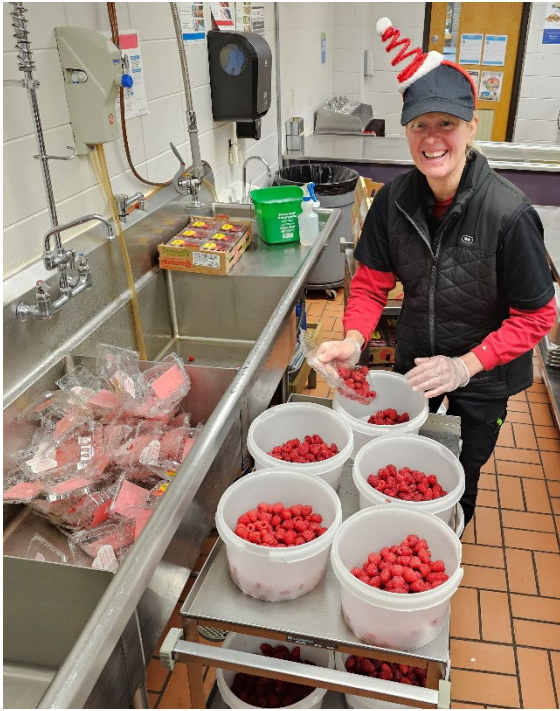
MAES staff working on FFVP. This week was raspberries and snap peas