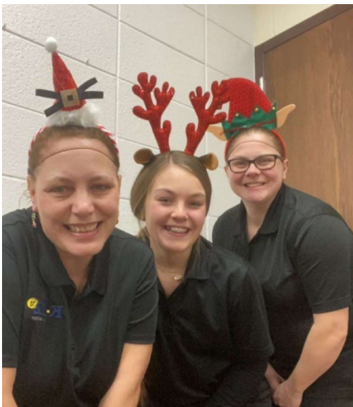
SES team dressing up for the Holidays

FFVP (Fresh Fruit Vegetable Program) has been running smoothly throughout both Elementary Schools serving on Tuesdays and Thursdays for all grades in those buildings.