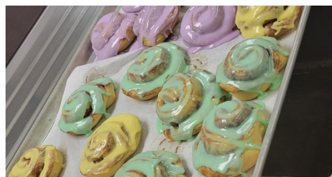
Spring cinnamon rolls at MAES. Yum!