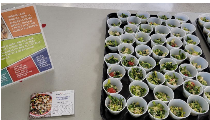
Food For Thought. Greek Chicken Cesear Salad.