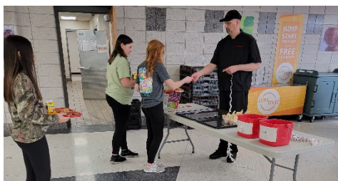
Students receiving their participation ticket to win a free a la carte item. Good Luck!