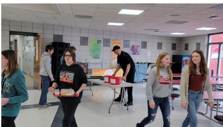
MAMS students sampling a new dish.