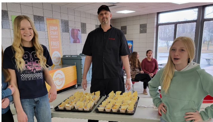
Food For Thought. Spicy Cod Tacos. Students loved them.