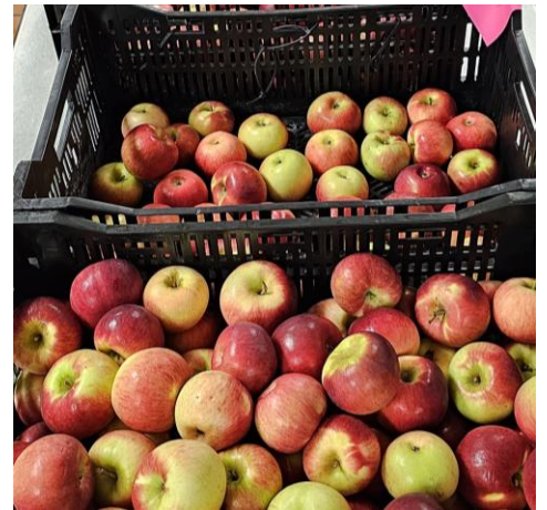
Another great shipment from Rock Ridge Orchard