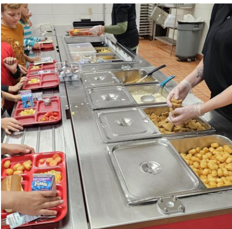
MAES enjoying an amazing meal