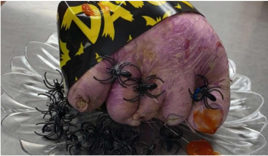
Daikon radish dressed up for Halloween.