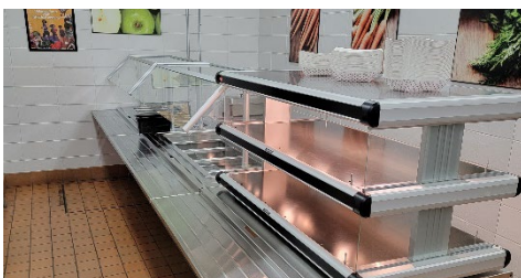
MASH new line.