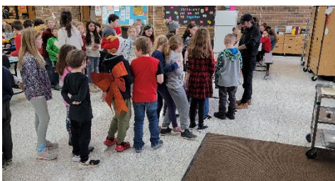
Students lining up for a demonstration.