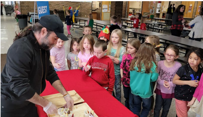
Students waiting for a taste.