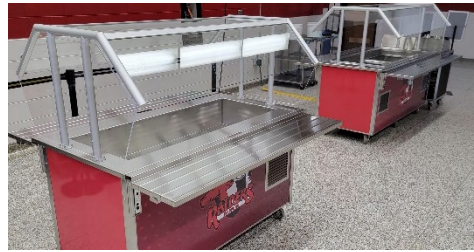
MASH new 2 nd serving line.