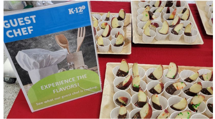
Apple slices dipped in chocolate with sprinkles. Easy to make but delicious.