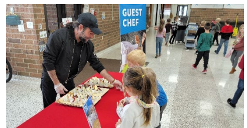
Free samples before Christmas.