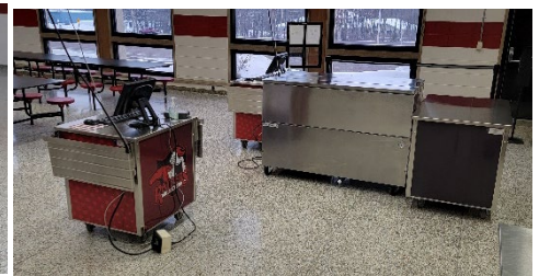
Great looking POS with the Raider logo.