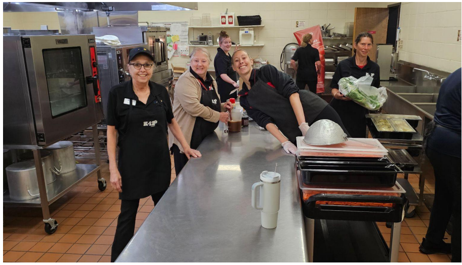
Elior staff grilling burgers and washing produce