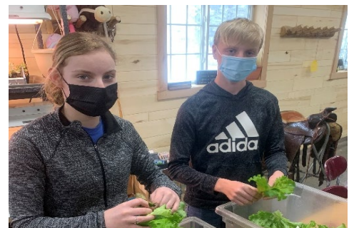
Keep up the good work.