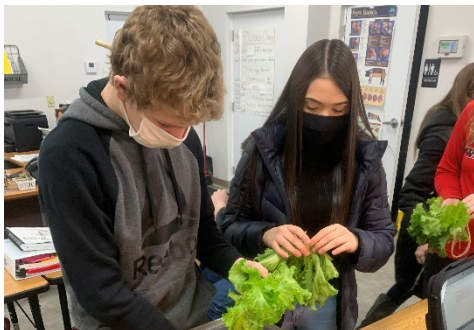
.Harvesting to go to the kitchen for lunch.