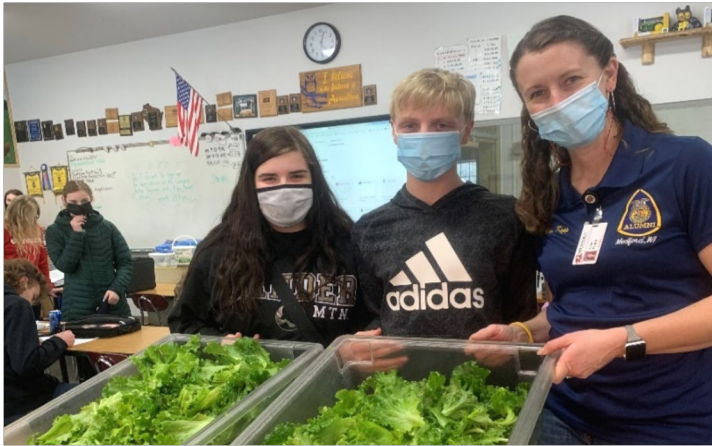
That's a nice crop of leaf lettuce.